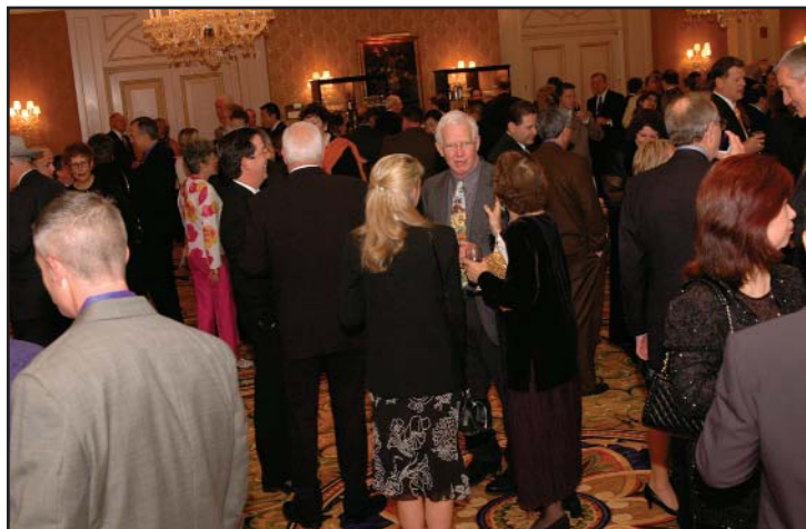
An intimate social reception was held before the awards and dinner. More than 300 attendees gathered in the ballroom foyer before the evening program.